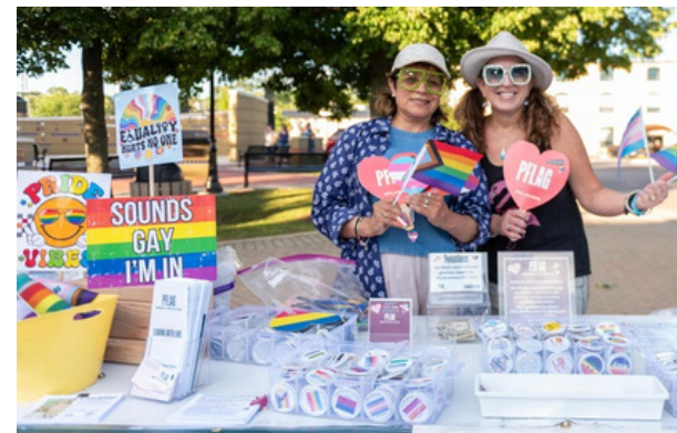
Express Yourself Fashion Show

We engaged in and thoroughly enjoyed a series of Pride events over the past month.